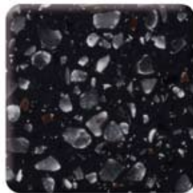
BLACK STORM - 4726 NEW