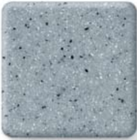
GRAY RIFF - 942