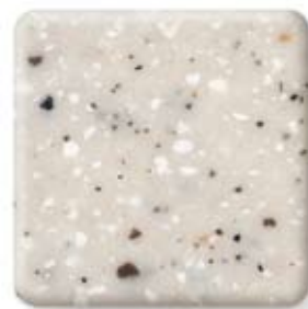
GALVESTON - 941