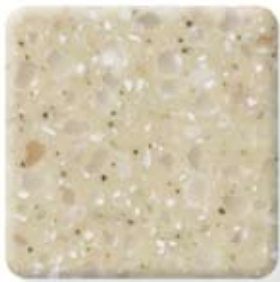
WHEAT BERRIES - 4723 NEW