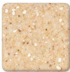
YELLOW STONE - 748