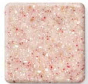
CRANBERRY FOAM - 943