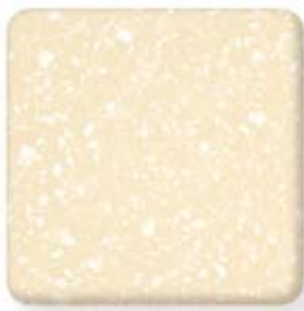
RIME FOG - 749