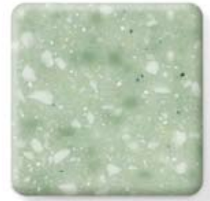
GREEN SURF - 939