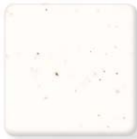
WHITE FLEECE - 742