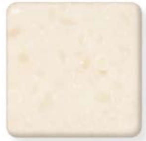
MOONLIGHT - 773