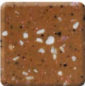
BETHANY - 960