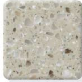
ROME BEIGE - 4722 NEW