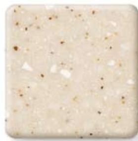
SARASOTA - 936