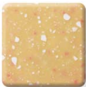
PANAMA - 965