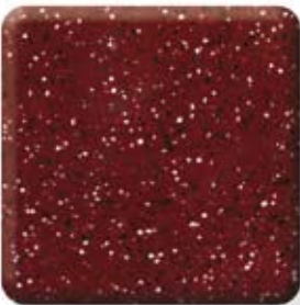
EMBER - 571