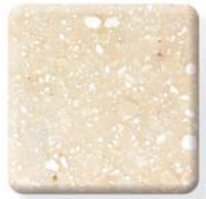
AVALON - 962