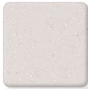
FOG - 744