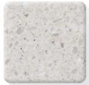
CREAMY WHITE - 4721 NEW