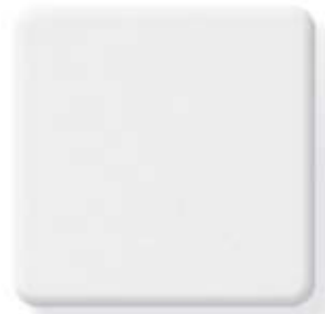
GLITTERING WHITE - 4232 NEW