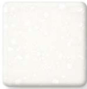
NAPLE WHITE - 937