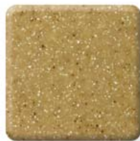
ASBURY - 961