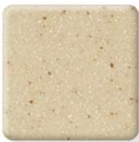
SEA ISLE - 935