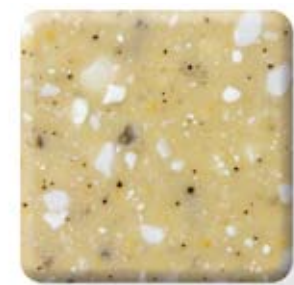
DAYTONA - 963