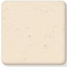
OATMEAL - 741