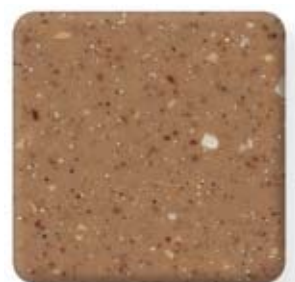
RUSSET TWEED - 772