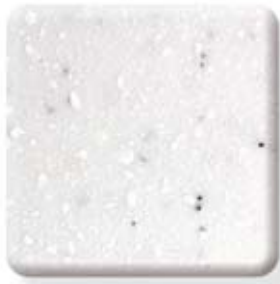
TUSCANY - 964