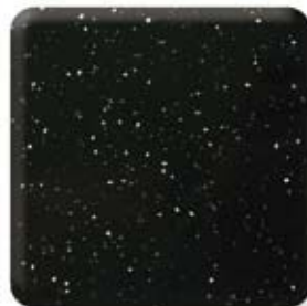
NERO ABSOLUTE - 944